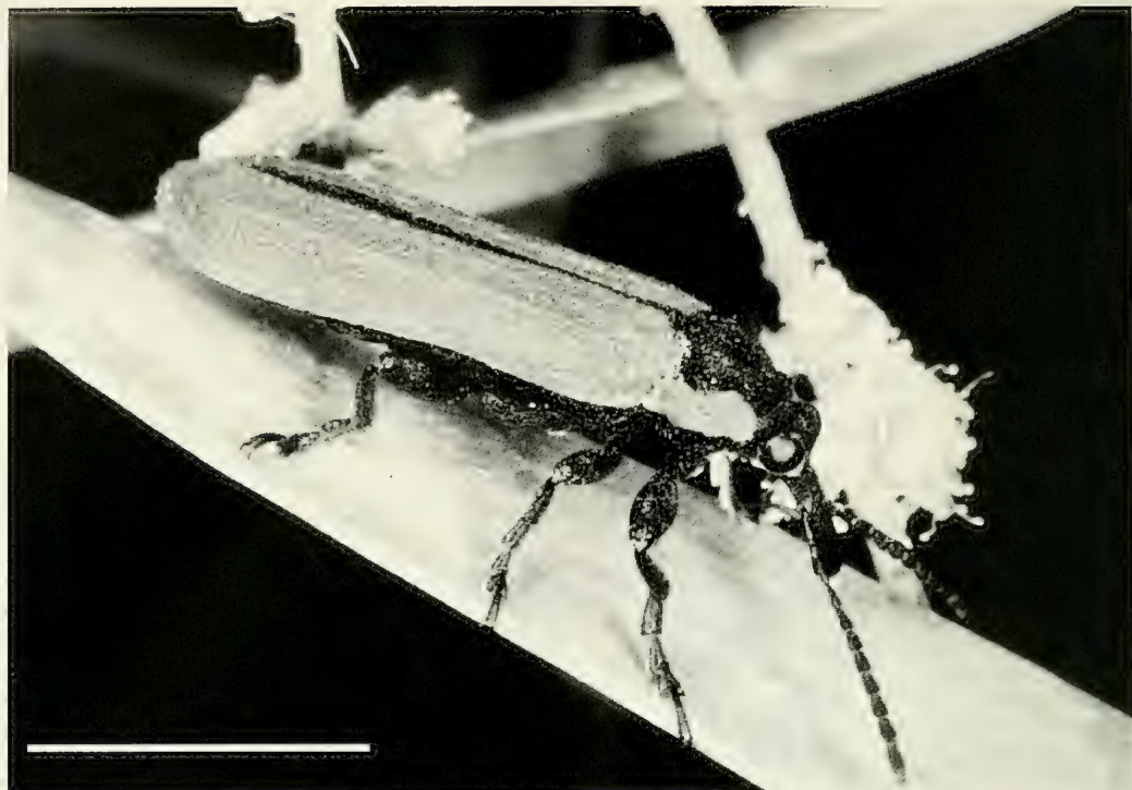
Fig. 1. Adult of Rhinotia haemoptera (Kirby) on the foliage of Acacia longifolia (Andr.) Willd. (Mimosaceae) at Batemans Bay, New South Wales, Australia. (Scale line = 10 mm). Photo: D. G. Knowles, from Hawkeswood, 1987a, 1990a.